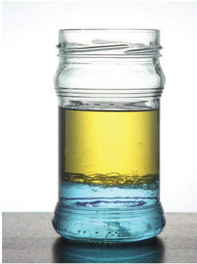
Free water is that which has separated out of the fuel to form a visible layer between the heavier water and the lighter fuel floating above the water.

Unfortunately, there are a number of ways for water to get into diesel fuel. As little as 100 parts per million of water in a diesel fuel tank can cause problems to develop. Studies have shown that diesel fuel degradation starts almost as soon as the fuel is produced and the fuel quality continues to degrade while it is being stored.